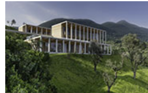
Project Eden: a new star-studded luxury resort opens by Lake Garda