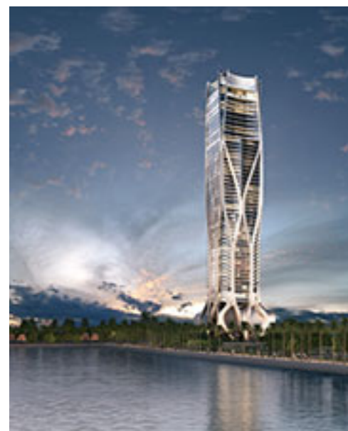
American dream: tour our pick of Miami's ongoing projects