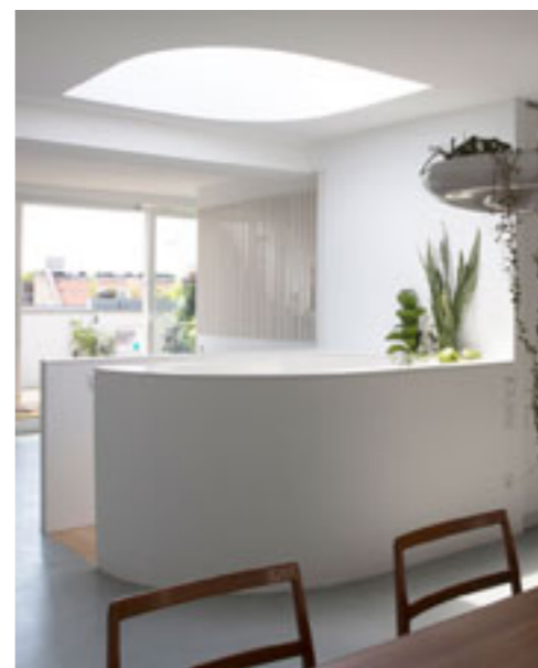
Wow haus: NOWlab's split-level Kreuzberg pile