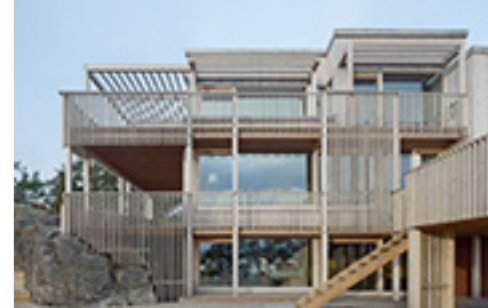
Villa Moelven is a surprising Swedish home inspired by the labyrinth